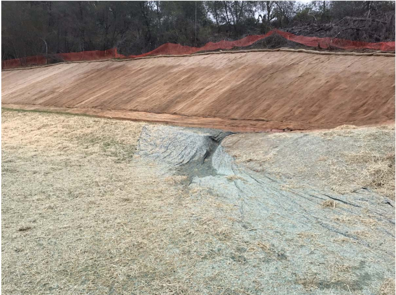
Pictured: New Erosion and Sediment Controls